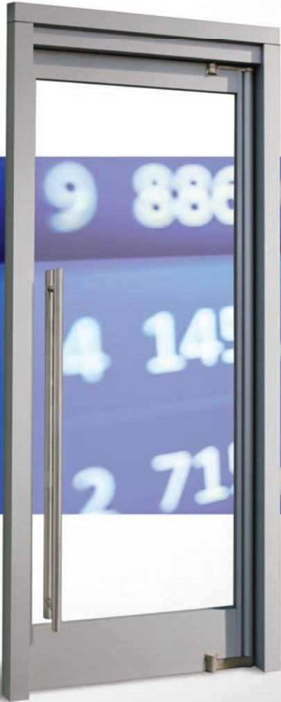
Four World Trade Center, New York

Like stock in the World Trade Center's blue chip tenants, Ellison commercial entry doors are a reliable long-term investment of the highest quality. It's no wonder the World Trade Center opens with Ellison.